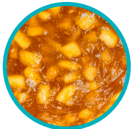
Just Right Apple