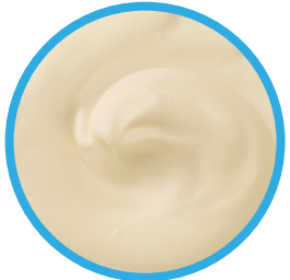
Plain Cream Cheese