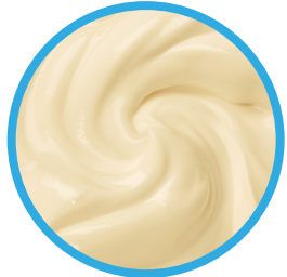
Sweet Cream Cheese