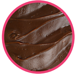
Chocolate Bavarian Creme